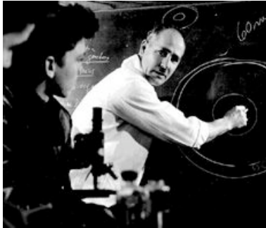
George Beadle at blackboard.