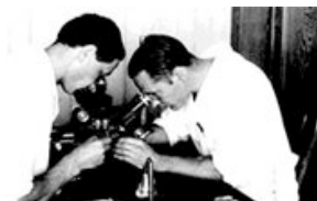
George Beadle and B. Ephrussi using microscopes.