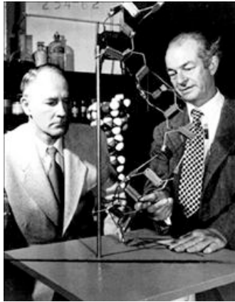
Beadle and Pauling with molecular model.

In 1946, Sturtevant and Linus Pauling (who was awarded Nobel Prizes in Chemistry, 1954 , and Peace, 1962 ) persuaded Beadle, who was then Professor of Biology at Stanford University , to become chairman of the Biology Division. Beadle carried on the Morgan tradition of strongly supporting basic research and maintaining a stimulating intellectual atmosphere. During the early 1930s Beadle had been a National Research Fellow in the Division. He had collaborated with Sturtevant on a monumental study of inversions and together they wrote a textbook of genetics. He had collaborated also during that time with Sterling Emerson, and with E. G. Anderson. Beadle was clearly a part of the Morgan legacy.