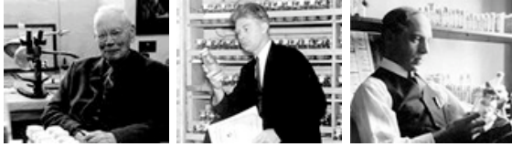
A. H. Sturtevant C. B. Bridges H. J. Muller

Courtesy of the Caltech Archives. © Copyright California Institute of Technology. All rights reserved. Commercial use or modification of this material is prohibited.