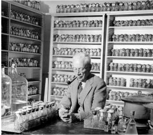
A. H. Sturtevant in the Drosophila stock room of the Kerckhoff Laboratories.

were quite disappointing. Fortunately, he persevered and found the white-eyed fly . This led to his discovery of sex-linked inheritance and soon with the discovery of a second sex-linked mutant, rudimentary , he discovered crossing over.