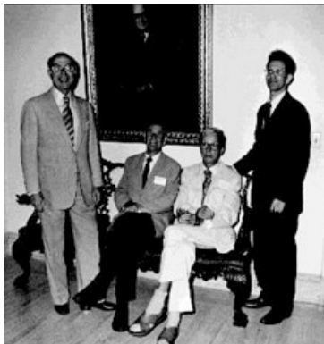
R. Dulbecco, G. Beadle, M. Delbrück, H. Temin.