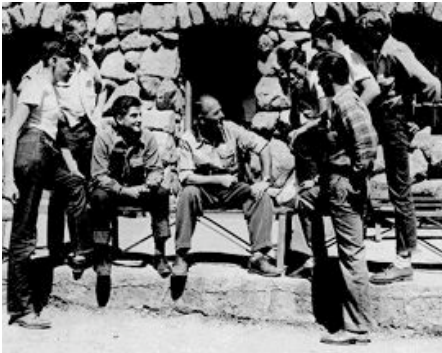
George Beadle and students.

Beadle had remarkably versatile skills. He early abandoned his research on Neurospora in order to devote full time to being chairman. He was very successful in finding donors to endow postdoctoral fellowships and new buildings. The fellowships were often used to support visits by foreign scientists who otherwise would not have had been able to come to the USA. As in the previous period, teaching loads were kept light and much teaching was conducted in the form of seminars and journal clubs. The biology faculty was by and large a harmonious group and students were allowed considerable freedom to choose their professors. As one of a number of measures of the success of this atmosphere, the Nobel Prize in Physiology or Medicine was awarded to Professors Delbrück, Dulbecco and Sperry, as already noted, and in my case as well, for work carried out in the Division under the leadership of Beadle.