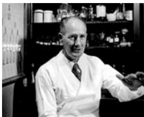
Beadle in lab coat.