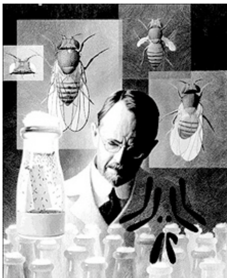
Thomas Hunt Morgan with fly drawings.