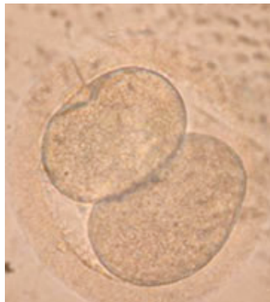
The embryos divided for 5 to 6 days and were then terminated.

Mouse stem cells have been made in a similar way, but transferring the technology to humans has proved problematic. The researchers attribute their success to the use of extremely fresh donor eggs and a new, gentler method for removing the DNA from donor cells.