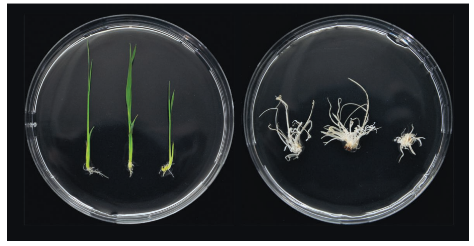
CRISPRed rice. Earlier this month, researchers showed CRISPR works in plants, such as rice, where the knocked-out gene resulted in dwarf albino individuals ( right ).

bacteria, the presence of Cas9 alone is enough to block transcription, but for mammalian applications, Qi and colleagues add to it a section of protein that represses gene activity. Its guide RNA is designed to home in on regulatory DNA, called promoters, which immediately precede the gene target.